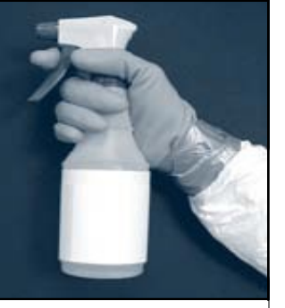
"Wet" Test Your Ceiling